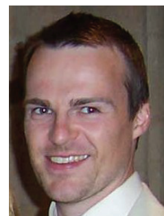
James Henstock Institute for Science & Technology in Medicine, Keele University Medical School, ST4 7QB, UK

Magnetic nanoparticles provide a unique approach to directing mechanotransduction in cells, and have several features which make them highly translatable to clinical situations. By surface coating a (superparamagnetic) iron oxide nanoparticle with biomolecules such as receptor ligands or mechanosensor-binding antibodies the nanoparticles can be very precisely targeted, allowing researchers to take control over individual mechanotransduction pathways by simply tailoring the size and coating of the particle. Once bound to the target receptor on the cell, applying a variable magnetic field (from either a moving array of permanent magnets